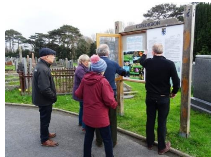
GAG installs the new display in Aberystwyth Cemetery explaining the wildlife management.