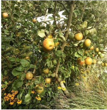
Afalau Cox Cymreig (Hydref 2022)

Bydd rhagor o goed yn cael eu plannu ar dir yr Ysgol Gymraeg ym mis Hydref, gan gynnwys dau fath o afalau Cymreig: Cox Cymreig (math wedi dod o ardal Wrecsam) ac Afal Ynys Enlli.