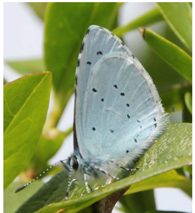
Glesyn y Celyn