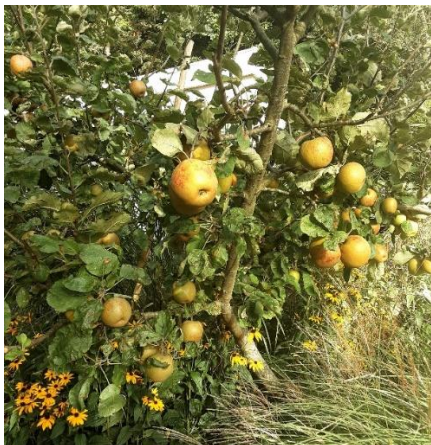
Welsh Cox apples in Autumn 2022

More trees will be planted in the grounds of the Ysgol Gymraeg in October, including two Welsh apple tree varieties: a Welsh Cox (a variety thought to originate from the Wrexham area) and a Bardsey.